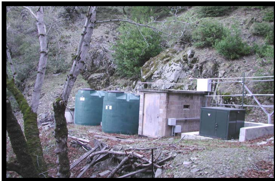
North Spring Storage Tanks