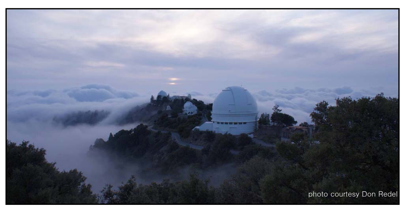
Page 6 of 9